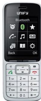
OpenScape DECT Phone SL5