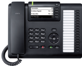
OpenScape Communication Point 400