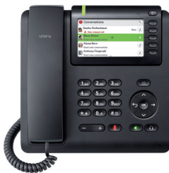
OpenScape Communication Point 600

OpenScape 4000 V8 supports the CP phone family in their SIP and HFA version. OpenScape 4000 can dynamically provide the cPxxx endpoints with the necessary SW (SIP or HFA) depending on the line configuration.