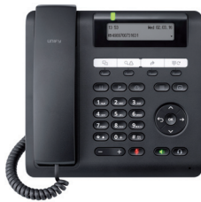
OpenScape Communication Point 200

Also with the new terminals, the customer can use the familiar scope of functionality!